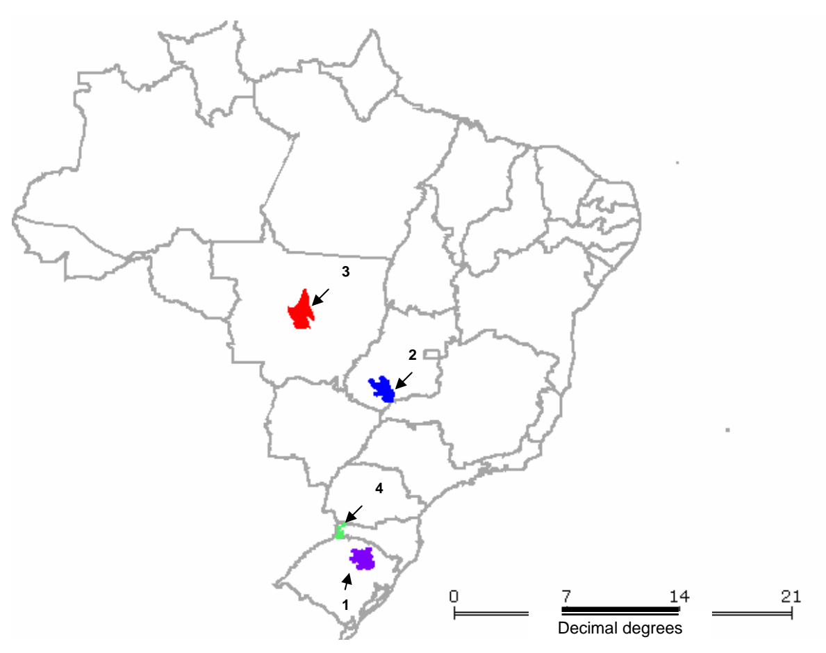
Figure 2. Production systems which will compose the studies of the compartment model definition of the Brazilian commercial poultry system localization.

The poultry production locations were identified for being situated in regions which possess a known sanitary situation for Avian Influenza and Newcastle Disease in the country. The production establishments belonging to this project all complies official biosecurity measures covered by the National Program of Poultry Health of the MAPA.