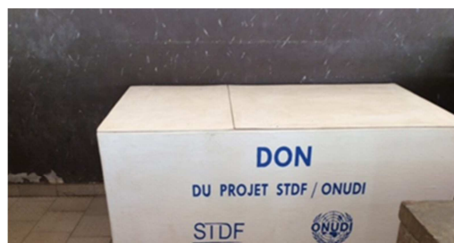
Better Isotherms allow adoption of improvements in SPS management and Access to Markets in Cote d'Ivoire

Project outcomes were achieved through the implementation of trainings and equipment, to facilitate SPS improvements of export value added to fisheries products. Study tours and regional exchanges were conducted, as well as the organization of cooperatives and groups with business linkages for access to regional and international markets for artisanal fisheries products.