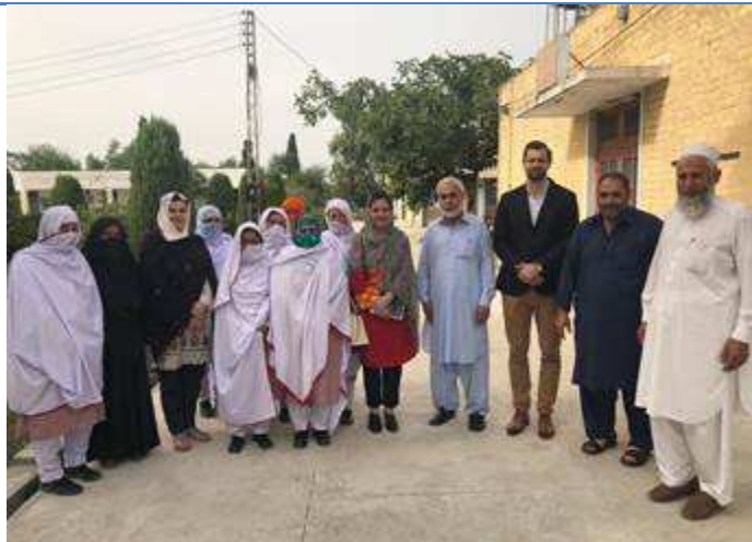
UNIDO visit to an agricultural training institute in Pakistan

UNIDO is currently conducting a mapping exercise and analysis on the compliance capacities of local suppliers through a survey addressed to several local and international companies. The survey aims to shed light on the ongoing and future supply needs of these companies and the food safety compliance level and issues of the suppliers, following UNIDO's Sustainable Supplier Development Programme (SSDP) thematic approach. As an outcome of this mapping exercise, UNIDO will be in the position to define the required capacity building needs and scope of these local food producers and manufacturers.