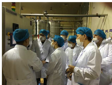
Discussion alongside the equipment for dairy product processing following the HACCP approach

It also facilitated the communication and knowledge building on food safety regulatory theories and practices, broadened the view and understanding of China’s trained inspectors, and accelerated the establishment of China’s own pool of experts. Through the exposure to best international practices regarding food and dairy safety supervision, functioning in both public and private sectors, UNIDO and the counterparts could further explore and expand collaborations with other China domestic and global stakeholders.