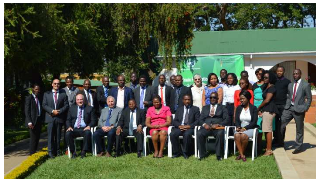
Participants during the Workshop on Trade Facilitation Toolkit, 29-30 May 2018, Malawi

In the effort to support the implementation of the WTO Trade Facilitation Agreement (TFA) in member countries, UNIDO is developing its Quality Infrastructure for Trade Facilitation (QI4TF) Toolkit, with funding from the German Federal Ministry for Economic Cooperation and Development. QI4TF aims to identify the technical gaps in the provision of national quality infrastructure systems that hinder the effective implementation of the TFA and proposes corrective measures in terms of capacity building, in both the immediate and medium-term. Overcoming these obstacles is key to demonstrating compliance with the WTO TFA, specifically articles 4.3, 5, 8 and 10.3.