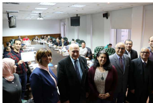
NFSA's team of core inspectors attending a 3-day training program on the "ServSafe" tool

Since the programme's kick-off in 2017, a series of interventions were launched which led to the reform of the relevant legal framework, the sensitization of more than 400 officials from relevant authorities, the implementation of a pesticide monitoring plan across the country and capacity-building for national inspectors.