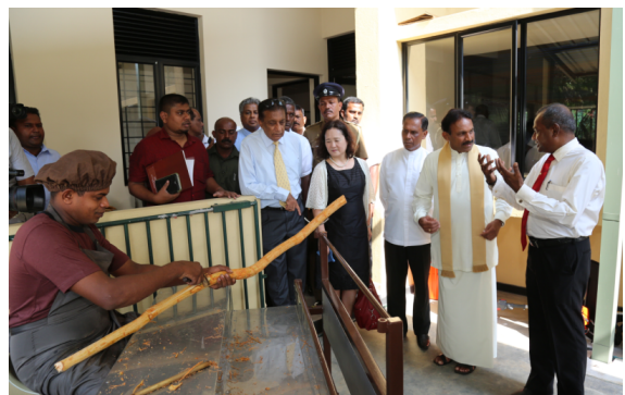
At the CTA Grand Opening Ceremony

Thematic areas: SPS, vocational training development, standard development