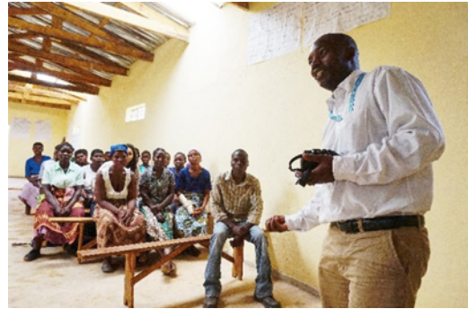
UNIDO NPC meets NASFAM farmers

Thematic areas: NQI, SQAM, SPS, SMEs development, standard development