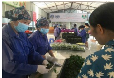
Farmers are learning skills for packaging

Thematic areas: food safety, post-harvest loss, technology, fruit and vegetable value chain