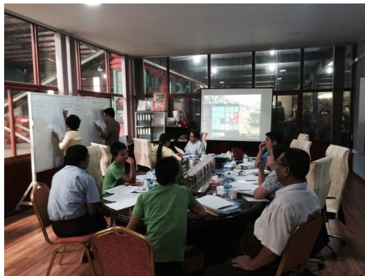
Food Safety team at work in a Beans Export Company

Thematic areas: food safety standards in industrial sector, institutional capacity building, food control system, standards and conformity assessment.