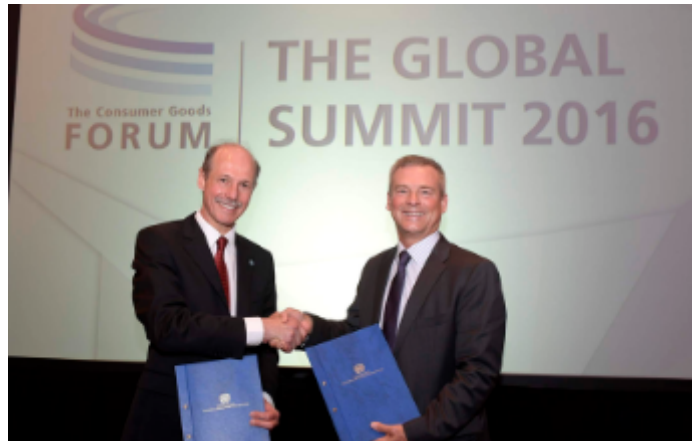
MoU signing ceremony between UNIDO and GFSI

After a long collaboration originally commenced under the Sustainable Supplier Development Programme (SSDP) project in Malaysia, UNIDO and the Global Food Safety Initiative (GFSI) have signed a Memorandum of Understanding (MoU) to indicate their commitment to a large-scale partnership for food safety. This ceremony took place at the gathering of the world’s consumer goods industry leaders at the CGF Global Summit on 15 June in South Africa. This partnership aims to implement “ a roadmap for scaling up ” the GFSI Global Markets Programme (GMP) by developing large-scale food safety capacity building project in a number of key regions in the global food supply network. This roadmap focused on food safety capacity programme will be implemented in a number of key geographical areas , first of all, starting with China, Southeast Asia and Africa .