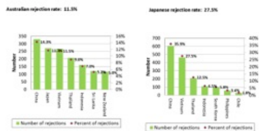
Rejection rate of Vietnamese seafood to Japan and Australia

Thematic areas: import rejection, seafood