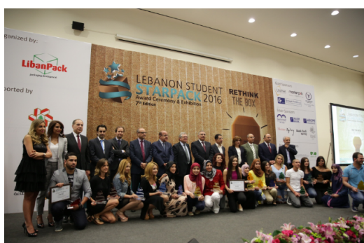
Arab StarPack event in Lebanon

Title of the project: Arab StarPack Initiative Country: Lebanon, Jordan, Palestine, Egypt Thematic areas: Packaging, TBT