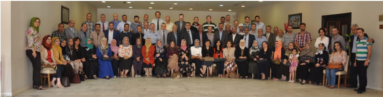
Group picture at the end of a training for Iraqi laboratory staff

Thematic areas: quality infrastructure, WTO accession, lab accreditation, certification