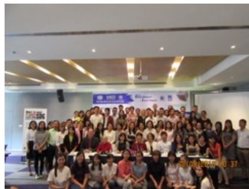
Participants of CSR Calendar Forum on Food Safety

Thematic areas: consumer's issues, consumer's trust on local products, cooperation with retailers, cross-cutting issue