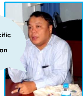
SIST NAUNG, TcC, Asia Pacific Inspection Agency Yangon