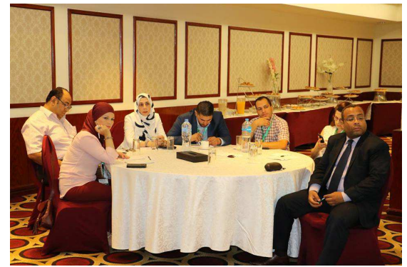
Participants of the AOAD Regional Training Workshop on SPS

from 13 Arab countries were trained and sensitized.