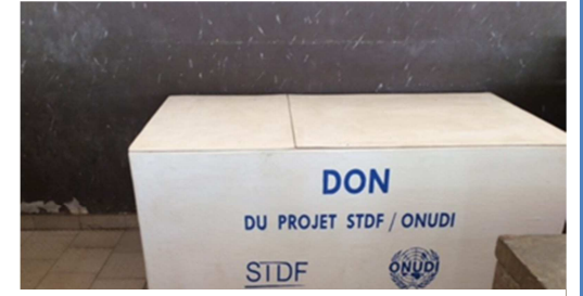
Better Isotherms allow adoption of improvements in SPS management and Access to Markets in Cote divore

Project outcomes were achieved through the implementation of trainings and equipment, to facilitate SPS improvements of export value added to fisheries products. Study tours and regional exchanges were conducted, as well as the organization of cooperatives and groups with business linkages for access to regional and international markets for artisanal fisheries products.