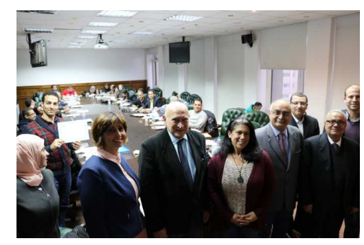
NFSA's team of core inspectors attending a 3day training program on the "ServSafe" tool

Since the programme's kick-off in 2017, a series of interventions were launched which led to the reform of the relevant legal framework, the sensitization of more than 400 officials from relevant authorities, the implementation of a pesticide monitoring plan across the country and capacity-building for national inspectors.