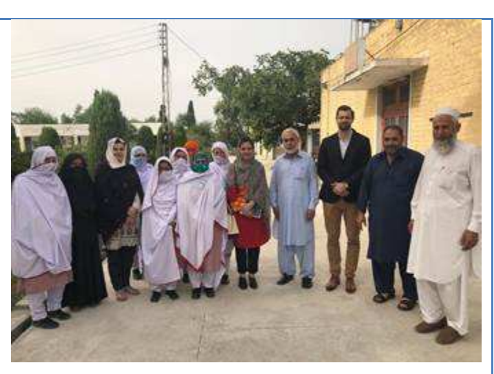
UNIDO visit to an agricultural training institute in Pakistan

Overall, UNIDO is involved in the formulation of two capacity building initiatives for Pakistan, where UNIDO will address food safety compliance issues of selected agri-food value chains in different provinces. Simultaneously the interventions will consider the adoption of adequate