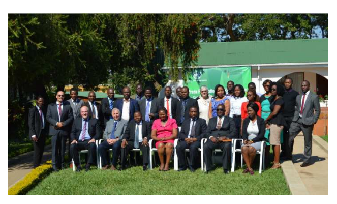
Participants during the Workshop on Trade Facilitation Toolkit, 29-30 May 2018, Malawi

QI4TF Toolkit is split in two parts aimed at measuring: 1) government and 2) industry capacity to facilitate exports. Each questionnaire in QI4TF1 and QI4TF2 aims to identify by sector